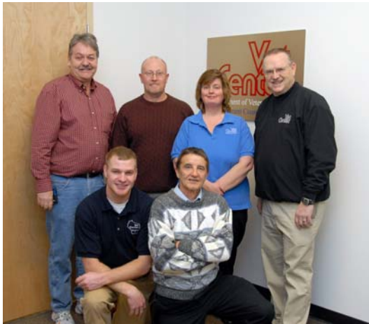
Madison Vet Center Team December 7, 2007