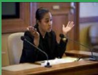
Setting the Record Straight on the Issues

Q: Can the money from the Federal Recovery & Reinvestment Package can be used to fill our budget gap?